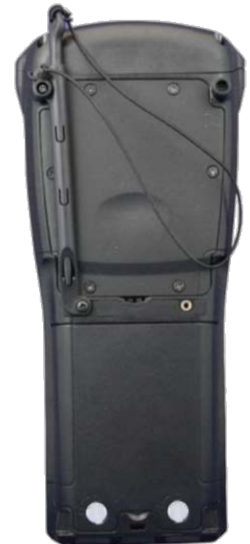
WA6310-G1 Mobile Stylus with Holder Kit