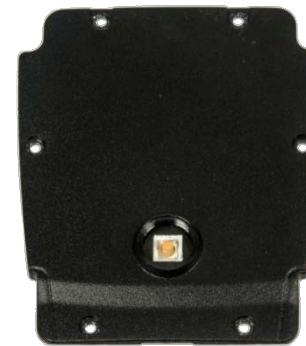
Trigger Board Back Cover

Trigger board WA9302 is required for 1D laser or 1D/2D imager ONLY when using the pistol grip