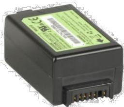
WA3010 4400 mAh