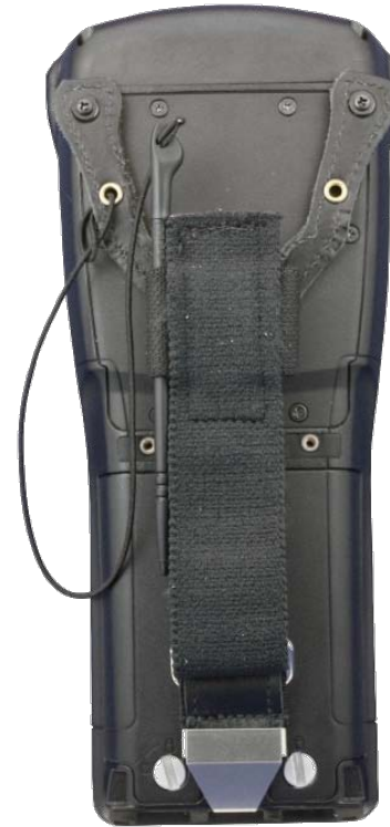
WA6025 Hand Strap with Mobile Stylus