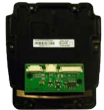
Inside Back Cover

WA9301 Trigger Board for Lorax Laser End-Cap