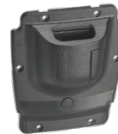
WA9015 1D Standard range laser