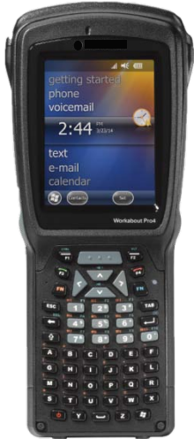
Microsoft Windows Embedded Handheld 6.5 Classic Edition