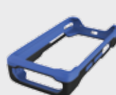
• 94ACC0132 Rubber Boot