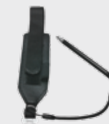
• 94ACC0133 Hand Strap (Included with purchase)