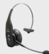
• 94ACC0127 Bluetooth Headset VX1 B350-XT